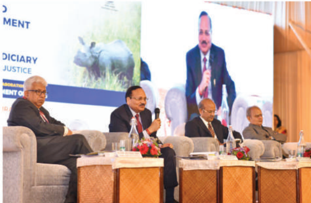
Justice Surya Kant, Judge, Supreme Court of India, interacting with the delegates