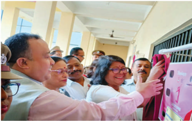
Inauguration of NIRMAL at Kamrup

Similarly, in Central Jail, Kamrup (Metro), such unit comprising of sanitary pad vending machine and incinerator have been installed. The ceremony was inaugurated by Member Secretary, ASLSA and IG, Prisons in presence of Additional District & Sessions Judge, Kamrup (Metro), Secretary, DLSA, Kamrup (Metro), Deputy Secretary and Under Secretary, ASLSA, Superintendent of jail, jailor and other officers and