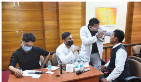
An eye check-up camp organized by GHEA.