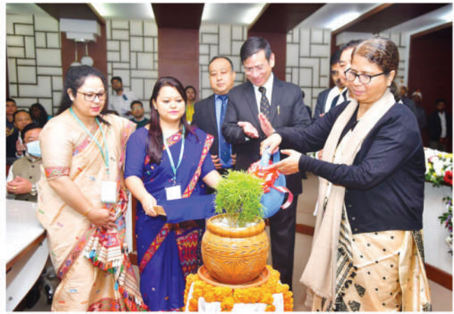
Smt. Ajanta Neog, Minister, Women and Child Development, Govt. of Assam watering the ceremonial plant