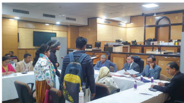
Justice Soumitra Saikia presiding over the National Lok Adalat

Khaund, Judges, Gauhati High Court presided over the Lok Adalats. A total number of 53 cases were disposed of during the Lok Adalat.