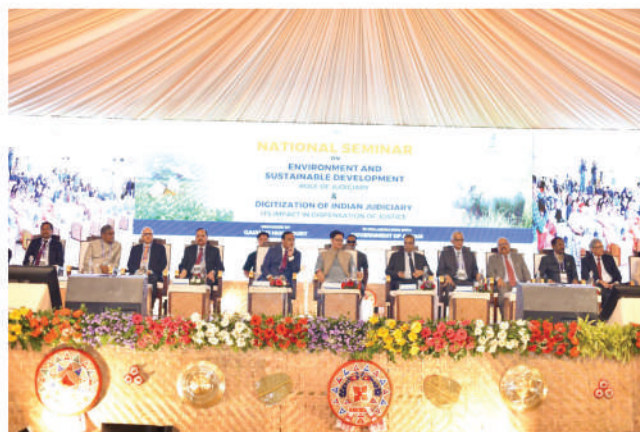
Dignitaries on the dias during the inaugural function.

The Gauhati High Court and the Government of Assam organized a National Seminar at Kaziranga, Assam on 29 th October, 2022. The two main agenda of the seminar were Environment & Sustainable Development – Role of Judiciary and Digitization of Indian Judiciary – Its Impact in Dispensation of Justice. The Seminar was inaugurated by Sri Kiren Rijiju, Union Minister of Law &