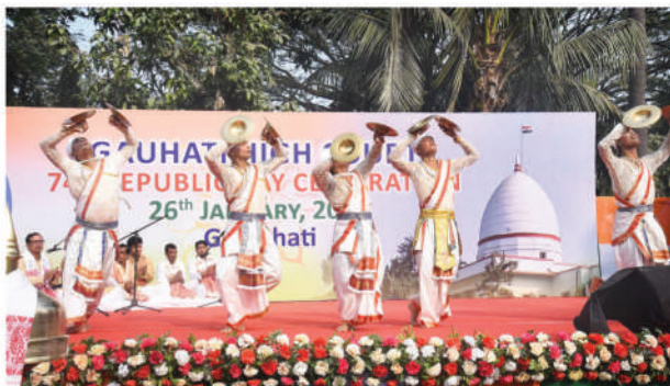
Sattriya dance performed on the occasion