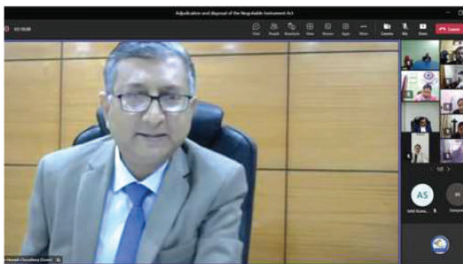
Justice Manish Choudhury speaking on NI Act on virtual mode

On 21 st January, 2023, a sensitization training programme was organized by Judicial Academy, Assam on virtual mode. Justice Manish Choudhury, Judge, Gauhati High Court was the Resource Person of the said programme and he spoke on the topic 'Adjudication and Disposal of the Negotiable Instruments Act Cases in the Light of Practice Directions Issued by the Gauhati High Court'. The said training programme was attended by the Grade II and Grade III Judicial Officers.