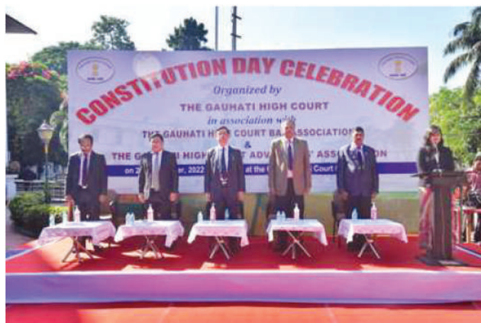
Judges paying respect to the National Anthem

On 26 th November, 2022, the Gauhati High Court celebrated the Constitution Day at the Gauhati High Court (Old Block) in association with the Gauhati High Court Bar Association and the Gauhati High Court Advocates' Association. The programme was organized to commemorate the adoption of the Constitution of India. The welcome address was given by Justice Lanusungkum Jamir, Judge, Gauhati High Court.