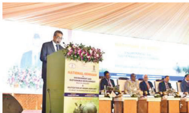
Justice M.R. Shah addressing the gathering during the inaugural session

Justice, Government of India, in the august presence of Dr. Himanta Biswa Sarma, Chief Minister, Assam, Justice M. R. Shah, Justice Surya Kant, Justice A. S. Bopanna, Justice S. Ravindra Bhat, Justice Hrishikesh Roy, Justice Vikram Nath, Justice C. T. Ravikumar, Justice M. M. Sundresh, Justice P. S. Narasimha, Judges, Supreme Court of India and