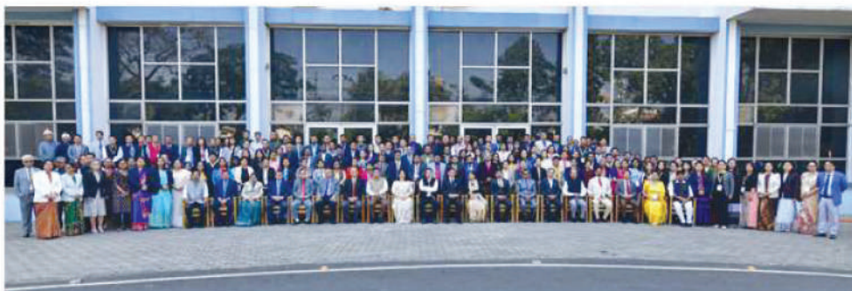
A group photo of the Judges, Resource Persons and participants from various states