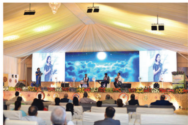
Artists performing during the cultural programme on 28 th & 29 th October

Project, Gujarat High Court attended the programme as resource person. The session was followed by a brief interaction session. Justice Michael Zothankhuma, Judge, Gauhati High Court offered the general vote of thanks.