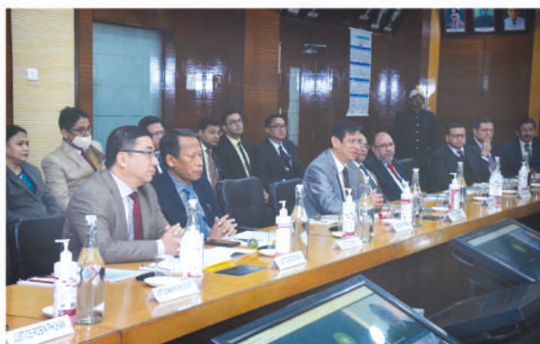
Judges present during the deliberation