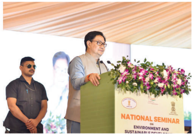
Mr. Kiren Rijiju delivering the keynote address.

the dignitaries on the dais. Dr. Himanta Biswa Sarma, the Chief Minister of Assam, also spoke on the occasion and lauded the decision of holding the seminar at Kaziranga which according to him conveys a powerful message on conservation of the Biodiversity. Sri Kiren Rijiju, the Union Minister for Law and Justice also spoke on the occasion. Justice