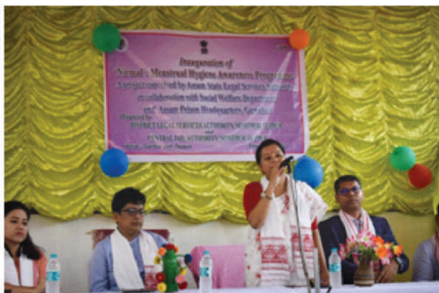
Inauguration of NIRMAL at Sonitpur