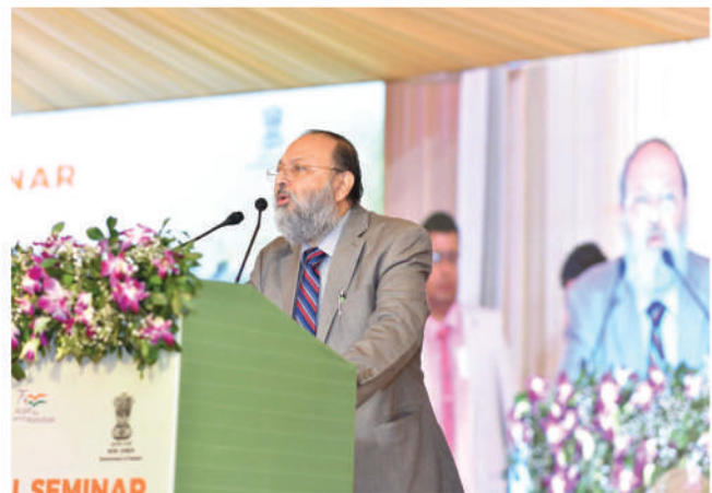
Justice A.K. Goswami speaking on sustainable development

The agenda for the second session was Digitization of Indian Judiciary – Its Impact in