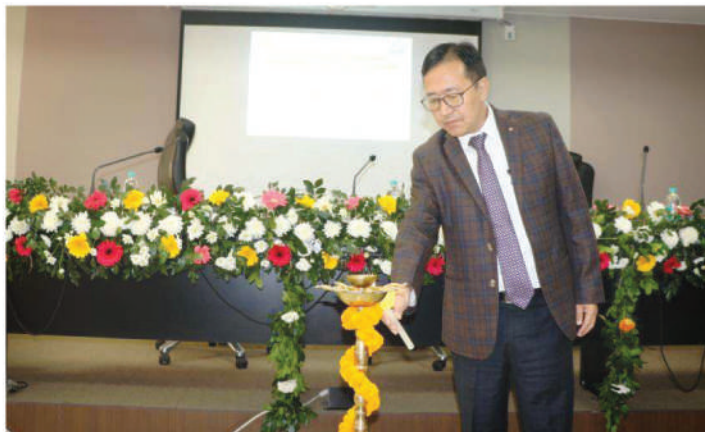
Justice Nani Tagia lighting the ceremonial lamp.

40 hours Mediation Training Programme for Judicial Officers of Assam was held on 29 th November to 3 rd December, 2022, at the conference hall, Judicial Academy, Assam at Amingaon. Justice Nani Tagia, Member, Mediation Monitoring Committee, Gauhati High Court, inaugurated the programme in presence of Justice Kakheto Sema, who is also a member of the Mediation Monitoring Committee, Gauhati High Court, other dignitaries and the participants of the training programme.