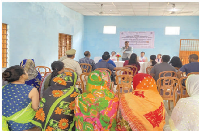
Inauguration of NIRMAL at Jorhat

Lions Club Smile , Silchar, along with the Secretary, DLSA, Cachar where the said machines were set to function after installation. The machines have been installed in the female ward of Central Jail, Silchar and would be operated by the jail inmates for which, necessary training shall be provided to them.