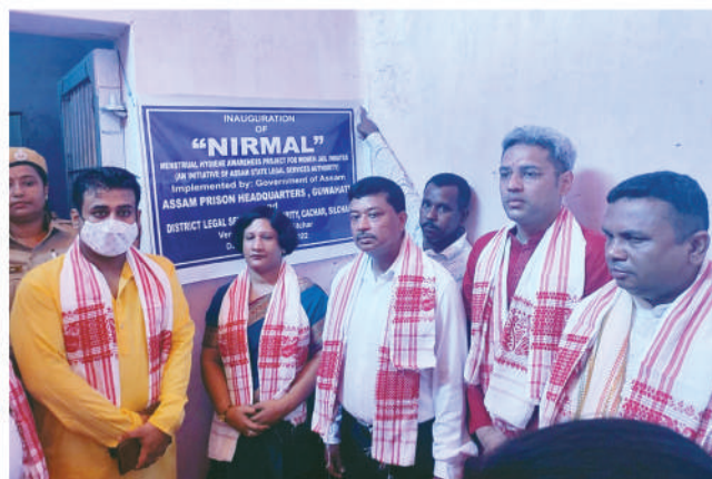
Inauguration of NIRMAL at Cachar

The District Legal Services Authority, Cachar, in collaboration with Lions Club Smile , Silchar had organized the launch and installation of two sanitary napkin vending machines and two sanitary napkin incinerator machines in the Central Jail, Silchar under the project, 'Nirmal'. The said programme was attended by the DIG, Southern Region; the Superintendent of Police, Cachar, Silchar. The Superintendent, Central Jail, Silchar; the President,