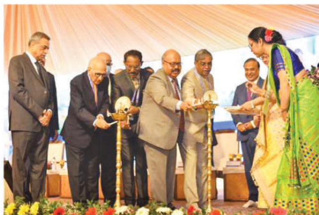
Dignitaries lighting the ceremonial lamp.