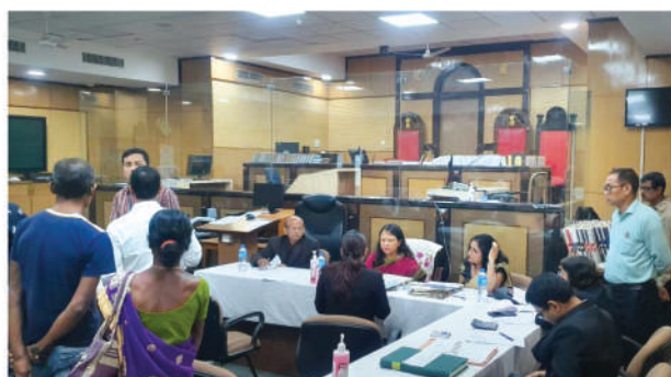
Justice Susmita Phukan Khaund presiding over the National Lok Adalat