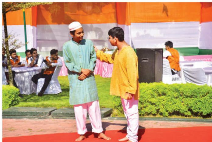
A skit performed during the programme