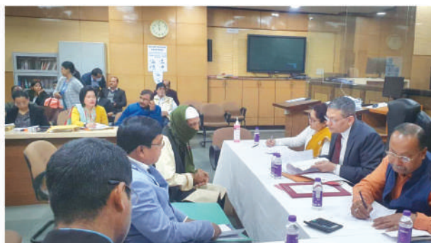
Justice Devashis Baruah presiding over the National Lok Adalat