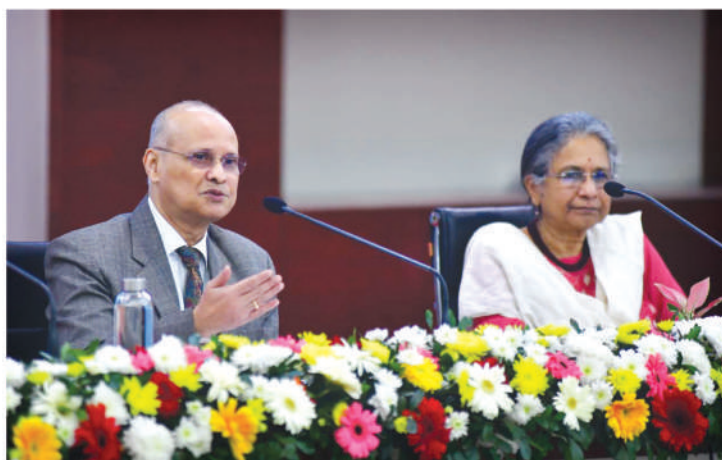
Justice Achintya Malla Bujor Barua and Priti Patkar interacting with the delegates

A State Level Consultation on Implementation of the Prevention of Child from Sexual Offences Act, 2012 was held on 26 th and 27 th November, 2022 at the Administrative Staff College, Khanapara, Guwahati. The programme was organized by the Juvenile Justice Committee, Gauhati High Court, in collaboration with Department of Women and Child Development, Govt. of Assam and UNICEF, Assam.