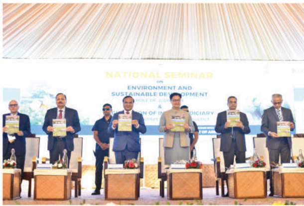
Dignitaries on the dias releasing the Special Edition of ATMAN