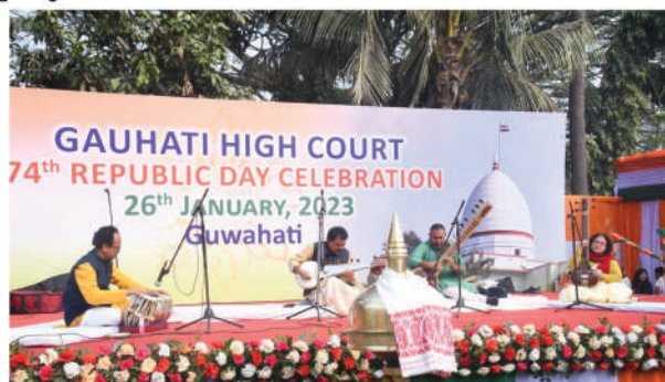
Parade taken out (left) & artists performing on the occasion (right)