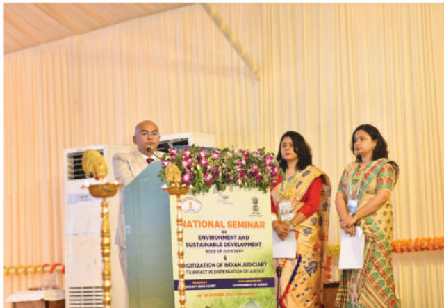
Justice Suman Shyam offering the vote of thanks

Suman Shyam, Judge, Gauhati High Court, offered the vote of thanks at the end of the inaugural programme.