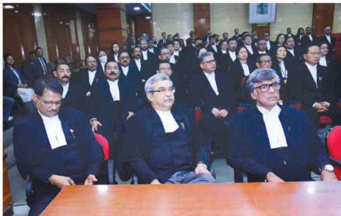
A section of the members of the bar attending the swearing-in ceremony