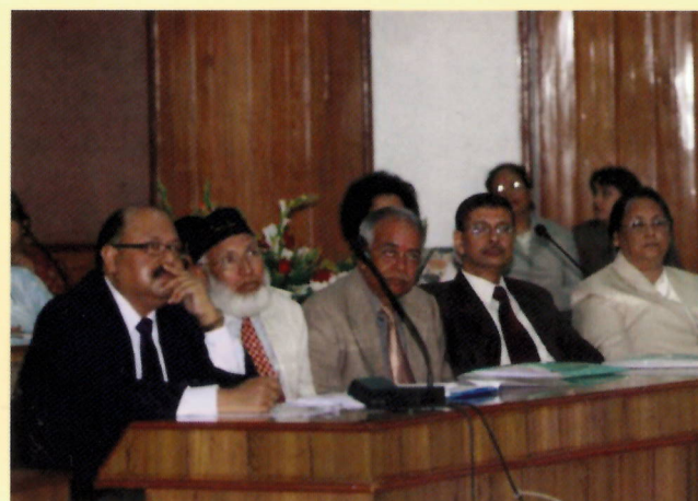
Hon'ble Judges at the Valedictory session.

Gauhati High Court has organized Pre-appointment Training for the candidates selected for appointment to Grade – III of Assam Judicial Service. The period of training is one year. First phase of the training was held at National Law School University, Delhi from 28.12.2008 to 31.05.2009 and the second phase has commenced at J.B. Law College, Guwahati from 05.06.2009 and will continue till 16.09.2009. The classes on various legal topics in the second phase have been taken by Hon'ble the Chief Justice of the Gauhati High Court, other Hon'ble Judges, former Hon'ble Judges of the Supreme Court and Gauhati High Court, faculty members of the NEJOTI, serving and retired Judicial Officers of Assam, experts from other specified field. Thereafter, trainees will have to undergo practical training in the District level Courts.