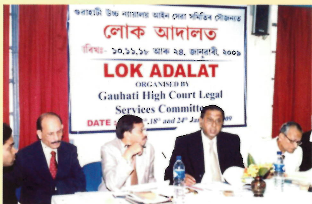
Hon'ble Justice Amitava Roy, Hon'ble Justice CR Sarma and other conciliators in settling disputes on 10 th Jan., 2009