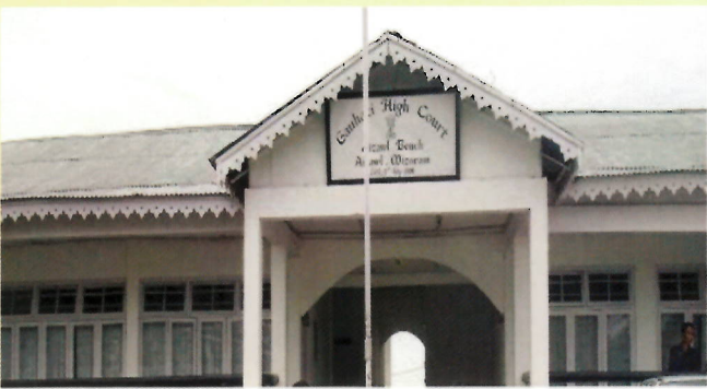
High Court Building, Aizawl Bench