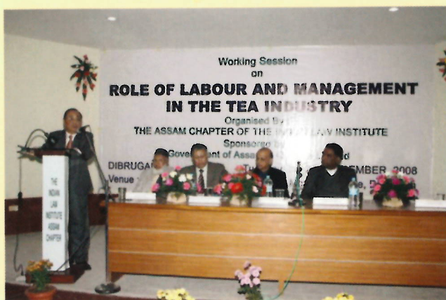
Mr. Justice Ranjan Gogoi, Judge, Gauhati High Court addressed on the subject 'Role of Labour & Management in the Tea Industry'.