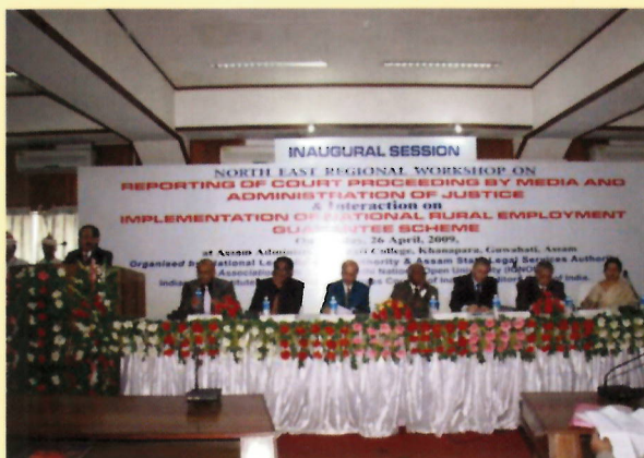
Welcome address by Mr. Justice Ranjan Gogoi, Judge, Gauhati High Court. Other dignitaries are seen on the dais.