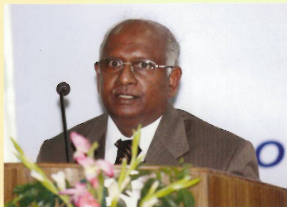
Inaugural address by Hon'ble the Chief Justice of India, Mr. Justice K.G. Balakrishnan.