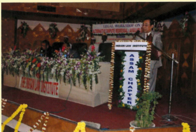
Hon'ble Mr. Justice Ranjan Gogoi delivering the Welcome address in the ADR Workshop.