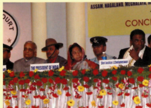
Her Excellency the President of India Hon'ble Mrs. Pratibha Devi Singh Patil attended as the Chief Guest in the closing ceremony of the Diamond Jubilee celebration on 4 th April, 2009.

Some of the glimpses of Diamond Jubilee Celebrations -