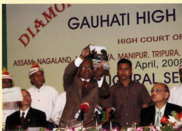
Release of ATMAN on the occasion of Diamond Jubilee Celebration of the Gauhati High Court.