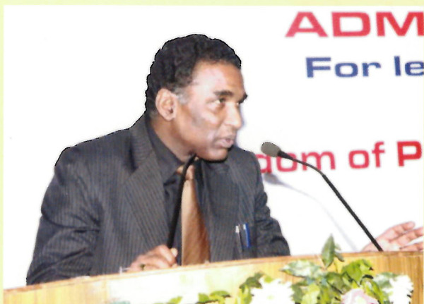
Keynote address by Mr. Justice J. Chelameswar, Chief Justice, Gauhati High Court, at the Valedictory session.