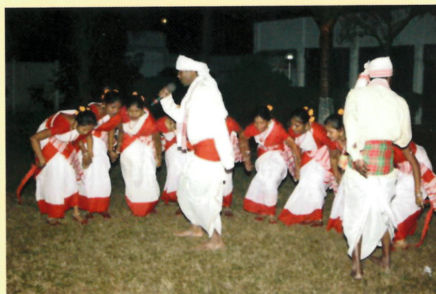
'Jhumur' dance of the tea tribe in the cultural function.