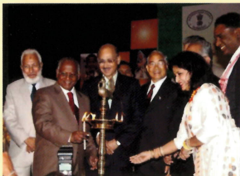
Hon'ble the Chief Justice of India, Mr. Justice KG Balakrishnan inaugurated the Diamond Jubilee Celebration by lighting the ceremonial lamp. Mr. Justice HK Sema, Judge, Supreme Court of India, Hon'ble Justice PP Naolekar, Judge, Supreme Court of India, Hon'ble Justice J. Chelameswar, Chief Justice and Hon'ble Justice Aftab H. Saikia (now Chief Justice of Sikkim High Court) are also seen.