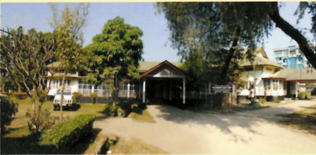
High Court Building, Imphal Bench