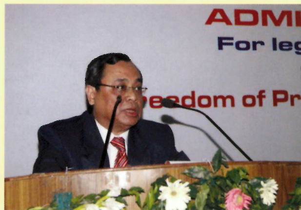
Address by Mr. Justice Ranjan Gogoi, Judge, Gauhati High Court, at the Valedictory session.