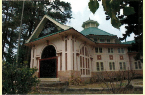
High Court Building, Shillong Bench.