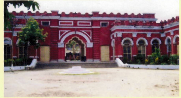
High Court Building, Agartala Bench.