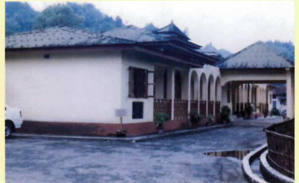
High Court Building, Itanagar Bench