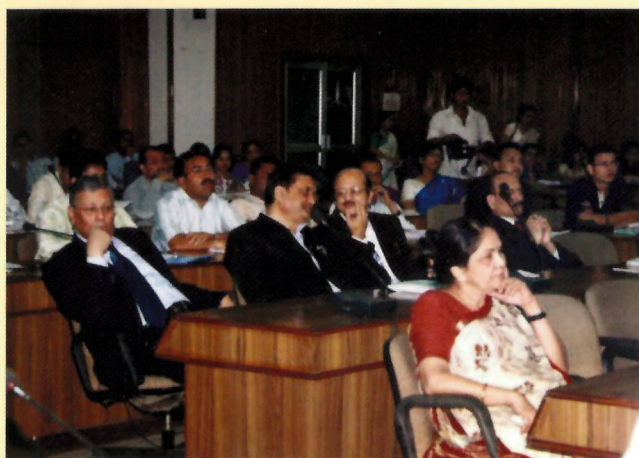
Hon'ble Judges along with a section of the audience