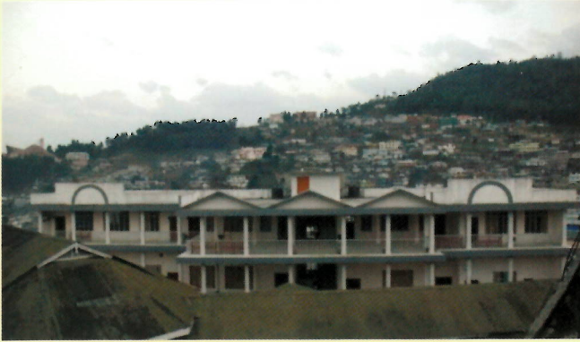
High Court Building, Kohima Bench