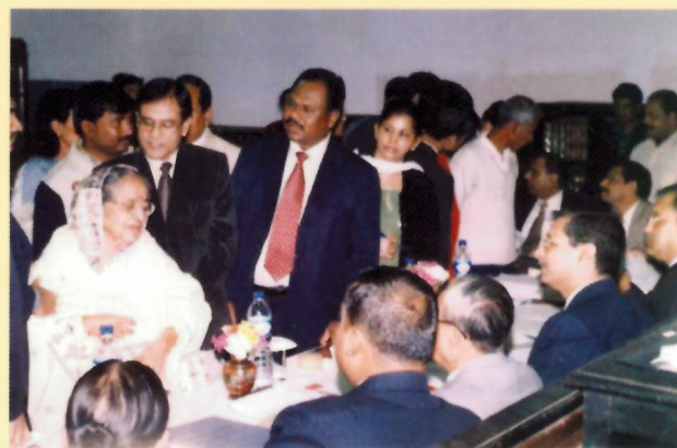
Hon'ble Justice B.P. Katakey is holding Lok Adalat held on 24 th January, 2009.