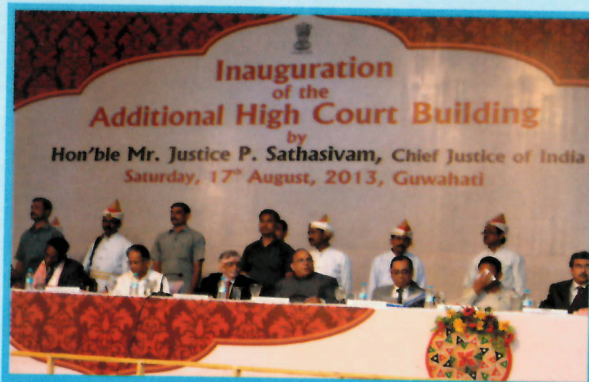
The Chief Justice P. Sathasivam and other dignitaries in the inaugural function of the new High Court Building.

The New Gauhati High Court Building was inaugurated by Justice P. Sathasivam, Chief Justice of India on 17.08.2013 in presence of the Chief Minister, Sri Tarun Gogoi, Justice A.K. Patnaik, Justice J. Chelameswar, Justice Ranjan Gogoi, Judges