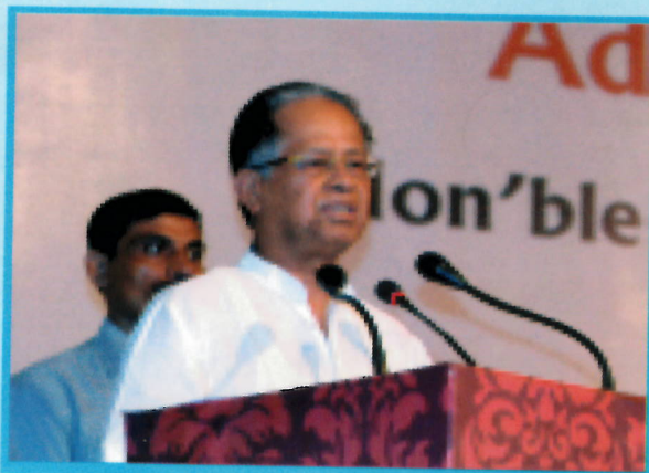
Sri Tarun Gogoi, Chief Minister, Assam addressing the gathering