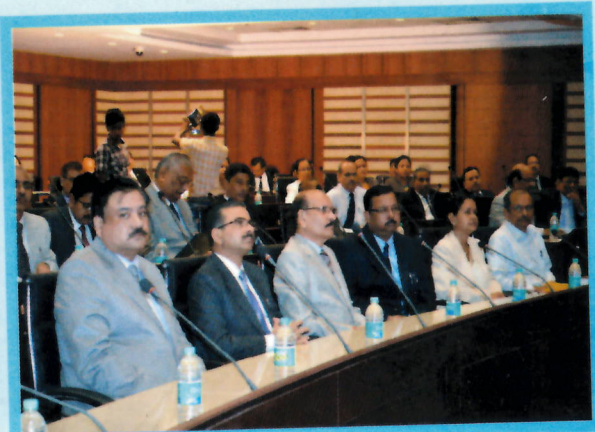
Judges of the Gauhati High Court during the East Zone Judicial conference