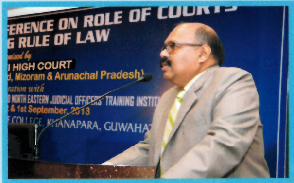
Justice Hrishikesh Roy, Judge-in-Charge, Training addressing on 'Access to Justice'