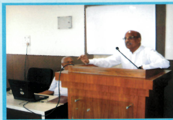
Justice P. G. Agarwal, Former Judge, Gauhati High Court on training of the public prosecutors