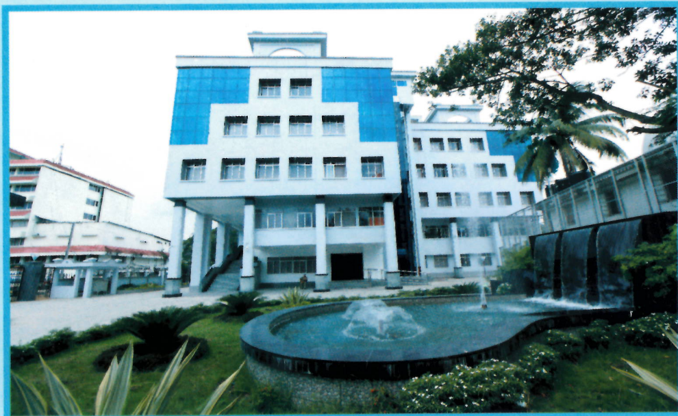
Front view - New Court Building