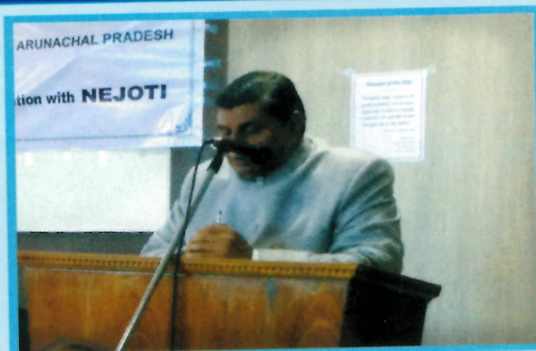
Dr. Justice B.S. Chauhan, Judge, Supreme Court of India, addressing the Judicial Officers in the Academy

Justice J. S. Khehar, Judge, Supreme Court of India addressed the Trainee Judicial Officers on 3 rd June, 2013. The erudite judge spoke on the functional aspect of judging and expectation from the judicial officers. The trainee officers had a lively interactive session in the 2 nd segment of the programme with Justice Khehar.