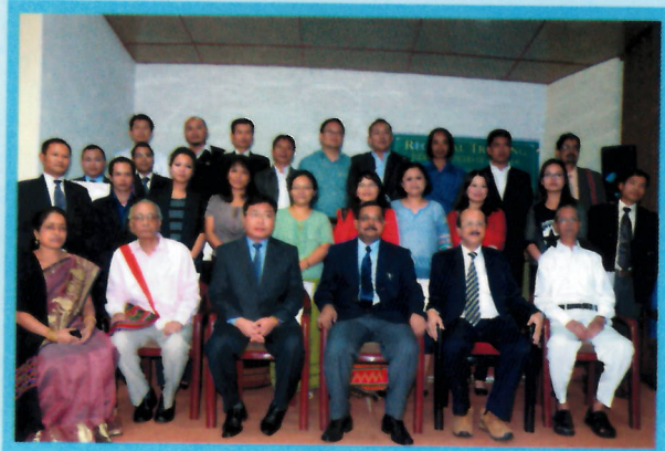
Participants with Judges during Valedictory Session.

We would not allow a man to perform a surgical operation without a thorough training and certification of fitness. Why not require as much of a trial judge who daily operates on the lives and fortune of others ?