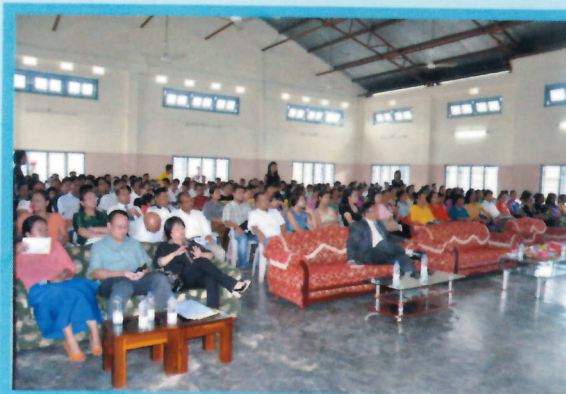
A section of the audience at Parish Hall, Kolasib in the legal awareness programme