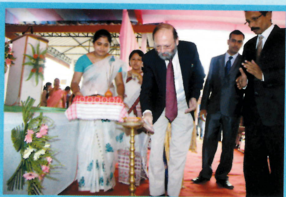
Justice A. K. Goswami, Judge, Gauhati High Court lighting the ceremonial lamp on the occasion of inauguration of the New Court Building at Sarupathar

The new sub-divisional court building at Sarupathar in the district of Golaghat was inaugurated by the portfolio Judge of the District, Justice A. K. Goswami on 7th September, 2013 in presence of the District & Sessions Judge, Golaghat, Sri T. Lohar, other Judicial Officers of the district, members of the Bar and Addl. Deputy Commissioner. Justice Goswami also spoke during the inaugural function.