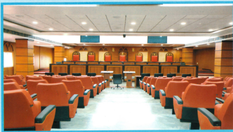
Inside view of Chief Justice's Court