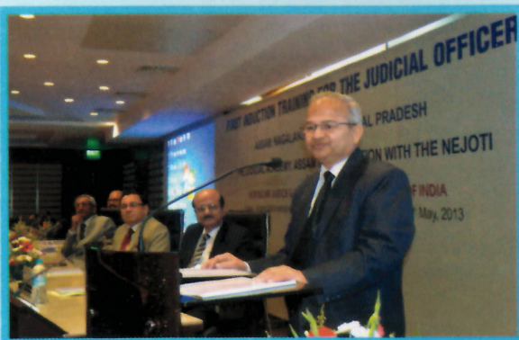
Justice G.S. Singhvi, Judge, Supreme Court of India addressing the officers