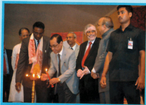
Justice Ranjan Gogoi, Judge, Supreme Court of India, lighting the ceremonial lamp