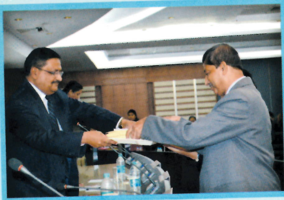
Justice S. J. Mukhopadhaya, Judge, Supreme Court of India distributing certificates to the participants