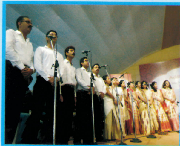
Chorus performed by the Member of the Bar and Staff of the Gauhati High Court in the inaugural function on 17.08.2013.

সুৰৰিছোঁ আজি তোমাৰ গৰিমা ন্যায় আৰু সমতাৰ তোমাৰ মহিমা দেশৰ বাবে নাগৰিকৰ বাবে Glorious Gauhati High Court