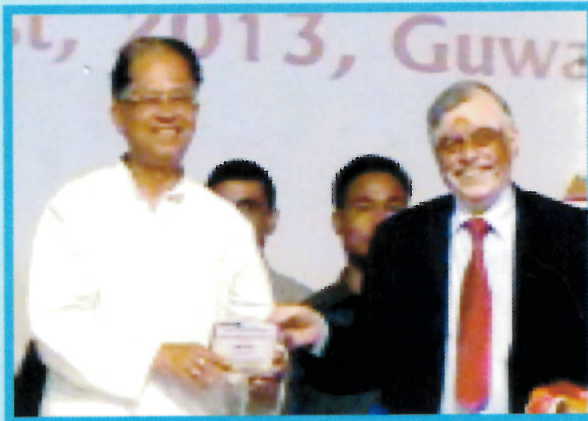
The short film 'XANKO" (The Bridge) on Mediation released by the Chife Justice of India and the Chife Minister of Assam