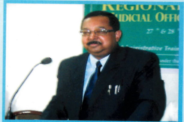
Justice Ujjal Bhuyan addressing the Judicial Officers in the Valedictory Session at Administrative Training Institute, Aizawl