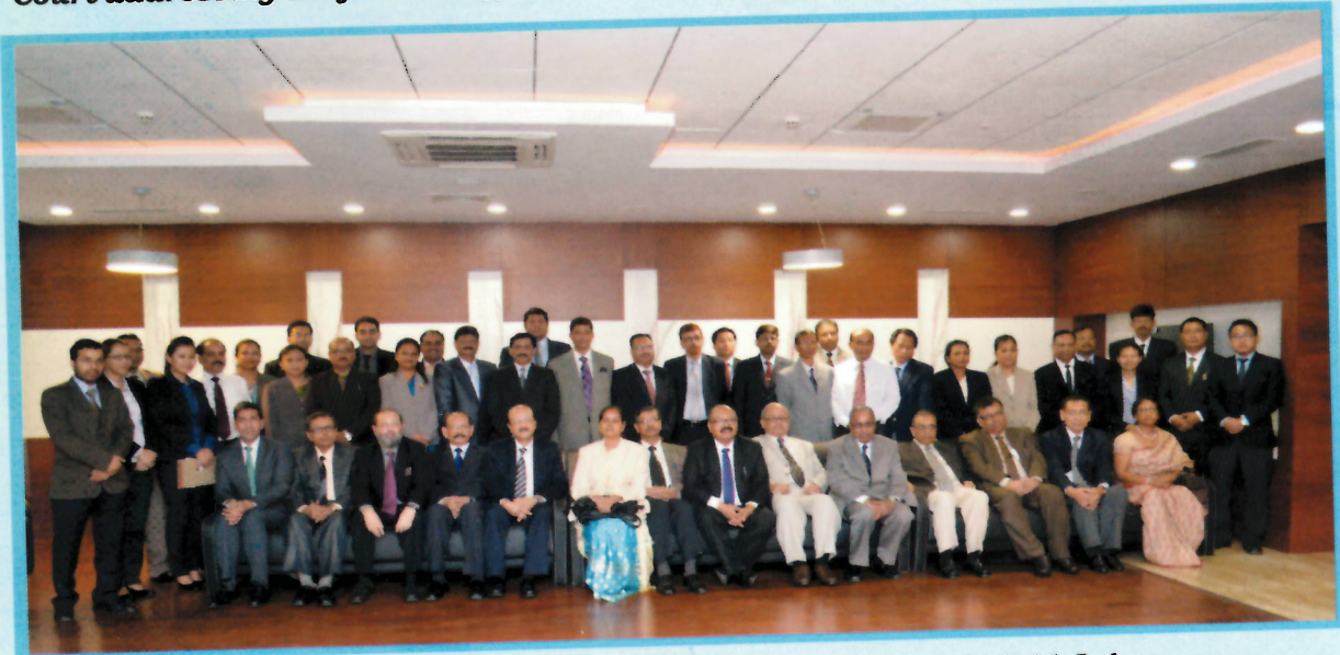
Few participants in the East Zone Judicial Conference photographed with Judges

The core of the existing principle of rule of law, I suggest, that all persons and authorities within the state, whether public or private, should be bound by and entitled to the benefit of laws publicly and prospectively promulgated and publicly administered in the courts.