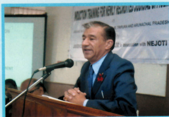
Dr. Ashwani Kumar, Governor of Nagaland addressing the Judicial Officers at the Judicial Academy, Assam

The Governor of Nagaland Dr. Ashwani Kumar, a former CBI Director spoke on the topic - Corruption in India and its Management in the Assam Judicial Academy on 28.06.2013. The Chief Justice of the Gauhati High Court, other Judges, Judicial Officers and members of the Registry were present on the occasion.