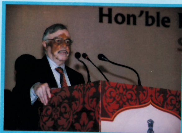
Justice P. Sathasivam, Chief Justice of India speaking in the inaugural function.