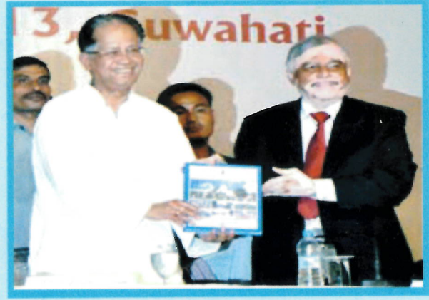
Justice P. Sathasivam, Chief Justice of India & Sri Tarun Gogoi, Chief Minister, Assam releasing the Annual Report, 2012 of the Gauhati High Court.