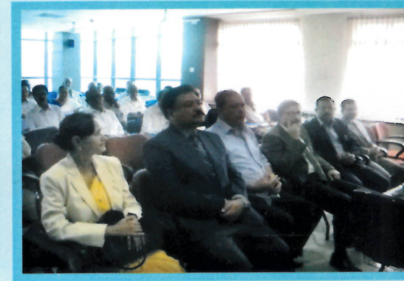
Judges of the Gauhati High Court attending the Inaugural Function of the Training of the public prosecutors.

The expected attitude of the Public Prosecutor while conducting prosecution must be couched in fairness not only to the court and to the investigating agencies but to the accused as well.