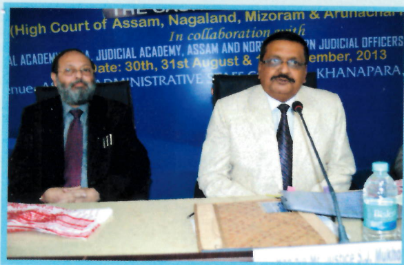
Justice S. D. Mukhopadhaya, Judge, Supreme Court of India addressing the conference. Alongside Justice A.K. Goswami.