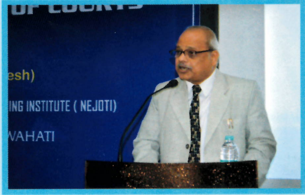
Justice P. C. Ghose, Judge, Supreme Court of India deliberating on 'Civil Administration'