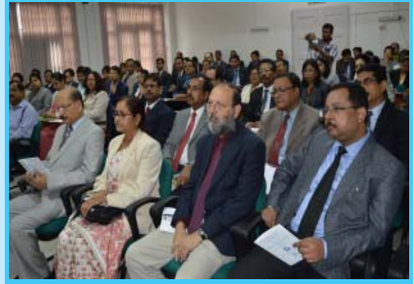
Judges and Judicial Officers present during inaugural session

In the two days programme, training was imparted to the judicial officers of Kamrup (Metro), Kamrup, Darrang, Udalguri, Nalbari and Morigaon, on the topics : Emerging Cyber Crimes and Threats in Cyberspace, Technical and Legal Challenges in Cyber Space, Appreciation of Electronic Evidence, Electronic Evidence Attribution, Crimes in Cyber Space, Digital Evidence and Cyber Forensics, Overview of Mobile Forensics.