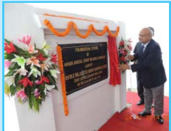
Chief Justice A.M. Sapre unfurling the plaque at Sivasagar

On 24.07.2014, the Chief Justice also inaugurated the Sub-divisional Court at Nazira, a historical town on the bank of river Dikhow in Sivasagar district. The Chief Justice also laid down the foundation stone of the new court building at Sivasagar, a historical town associated with the Ahom Kings. The District and Sessions Judge, Sivasagar, judicial officers, a few members of registry of Gauhati High Court and members of Bar were present during the occasion.