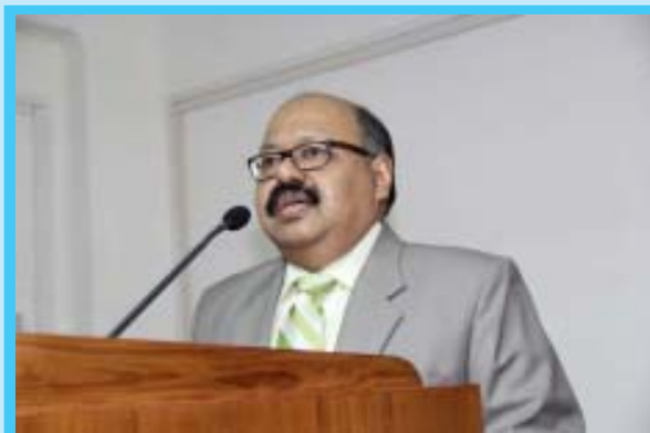
Justice Hrishikesh Roy, Judge In-Charge Training with his inaugural address

The Courts need management, which busy and overworked judges, with drastically increased caseloads, cannot give. We need crops of trained administrators or managers to manage and direct the machinery so that judges can concentrate on their primary duty of judging.