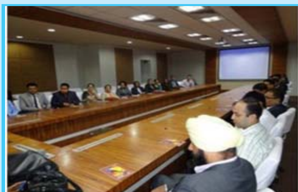
Judicial Officers present in the programme