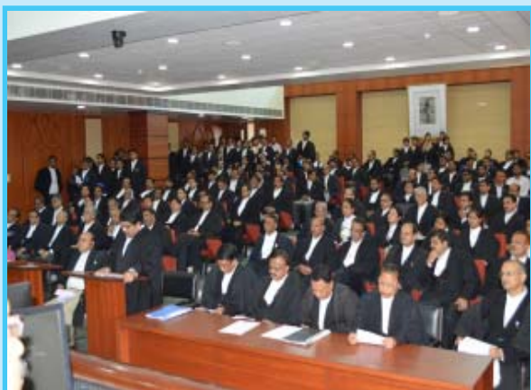
A section of Lawyers during Farewell Reference