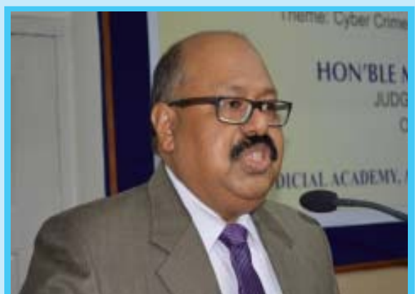
Justice Hrishikesh Roy, Judge-in-charge, Training with his welcome address