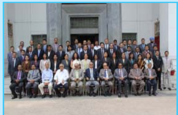
Judges with the participants

The mission of judicial education is most commonly to improve the quality of judicial performance by helping judges to acquire and maintain the tools for professional competence. Judicial competence is variously defined, but, for practical purposes, involves three distinct components (i) mastery of legal knowledge , (ii) development of professional skills , and (iii) acquisition of judicial disposition . — Livingston Armytage