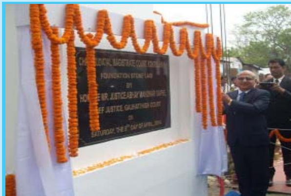
Chief Justice A.M. Sapre unfurling the plaque

Chief Justice A.M.Sapre (now in Supreme Court) laid down the foundation stone of the new CJM Court Building at Kokrajhar on 5 th April, 2014 in a simple function organized by the district judiciary. The Registrar General, the District and Sessions Judge, Kokrajhar, Judicial Officers and members of the Bar were present during the occasion.