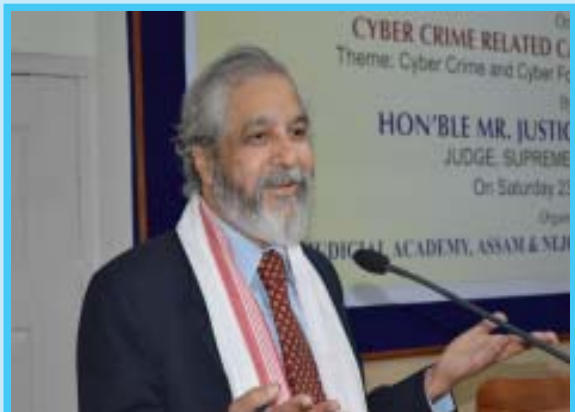
Justice Madan B. Lokur with his inaugural address