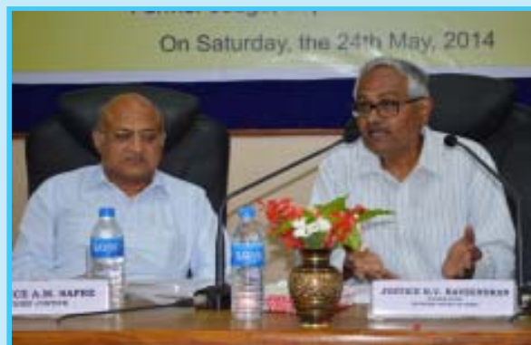
Justice Raveendran addressing the Judicial Officers

The Judicial Academy, Assam and NEJOTI organized a valedictory function for the Grade-III Judicial Officers of Assam, Nagaland and Arunachal Pradesh on 24 th May, 2014, on their completion of the induction training, in the conference hall of the Judicial Academy. Justice R.V. Raveendran, a former Judge of Supreme Court of India, addressed the Judicial Officers on 'How to be a good Judge' . The erudite speaker shared his knowledge with the new recruits to develop their Judicial and Administrative skills and urged upon the judicial officers to maintain ethical standards in adjudication. Justice A. M. Sapre, the then Chief Justice of Gauhati High Court, delivered the welcome address and Justice Hrishikesh Roy as the Judge In-charge, Training, by his motivating speech asked the judicial officers to strive to achieve the best of their potential. In this function certificates and two invaluable books were distributed to all the judicial officers.