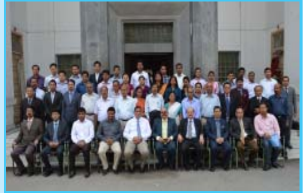
Dignitaries with Court Managers and Registrars