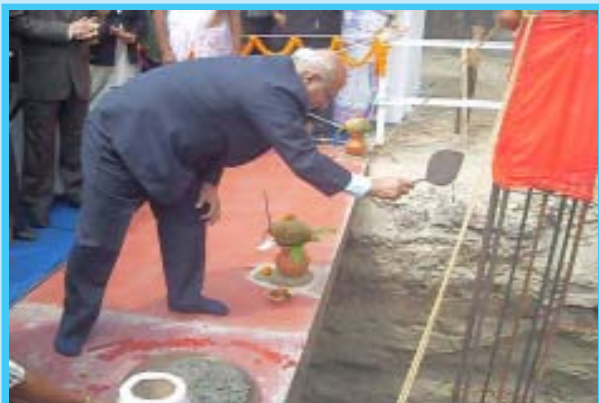
Chief Justice laying the foundation stone of the Court Building