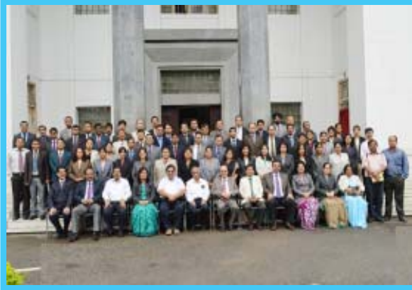
Participants of the programme with the Director and Resource persons