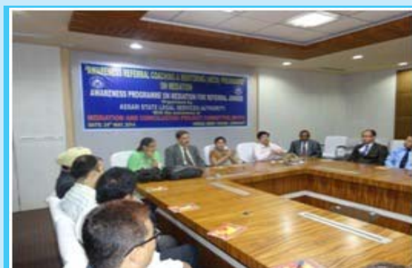
Member Secretary, ASLSA with Trainers