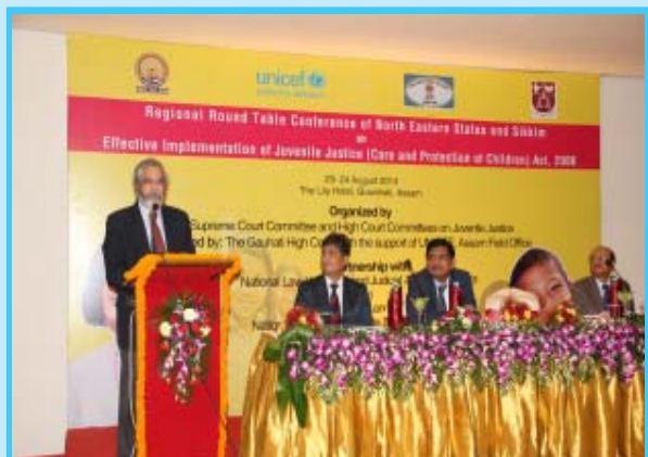
Justice Madan B. Lokur with his views during inaugural session