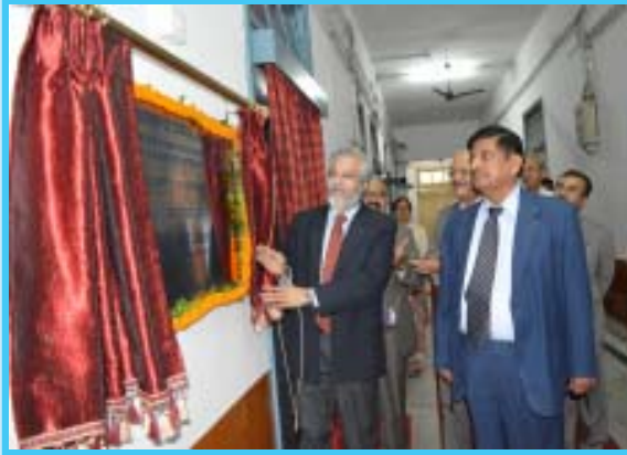
Justice Madan B. Lokur unfurling the plaque of ICT Lab