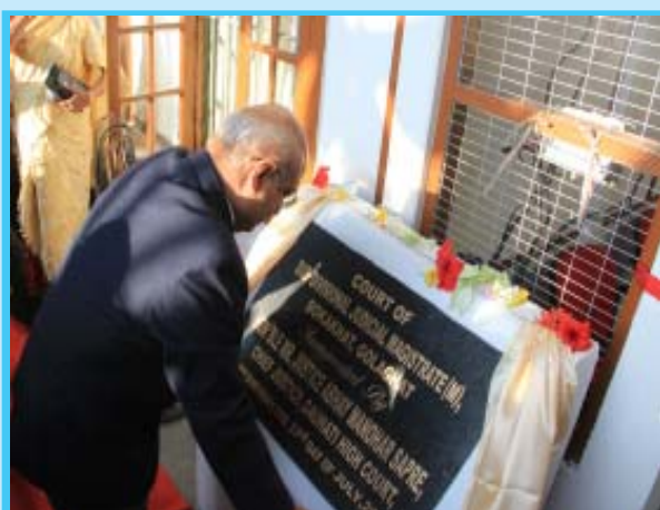
Chief Justice A.M. Sapre unrolling the plaque at Bokakhat

During the same trip, the Chief Justice also inaugurated the Sub-Divisional Court at Bokakhat in Golaghat district. The new court is at a distance of 23 K.M. from the famous Kaziranga National Park. The programme was attended by the District and Sessions Judge, Golaghat, a few members of the Registry, members of the Bar and litigants.