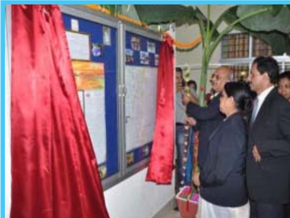
Chief Justice A.M. Sapre unrolling the wall magazine at Tezpur Court Complex