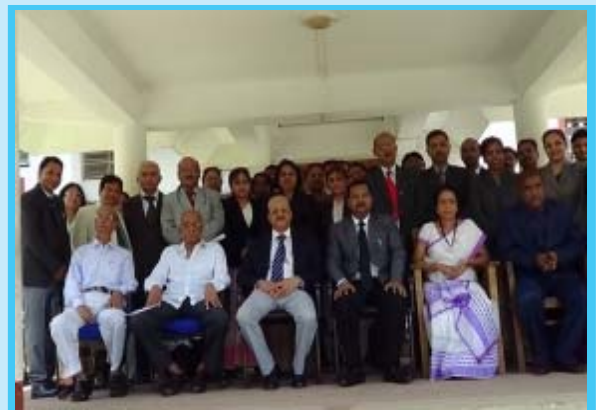
Judges with Participants at Goalpara

Continuing judicial education is assuming a potentially significant role as an agent of leadership and change, which is relatively new to both common law and civil systems of justice.