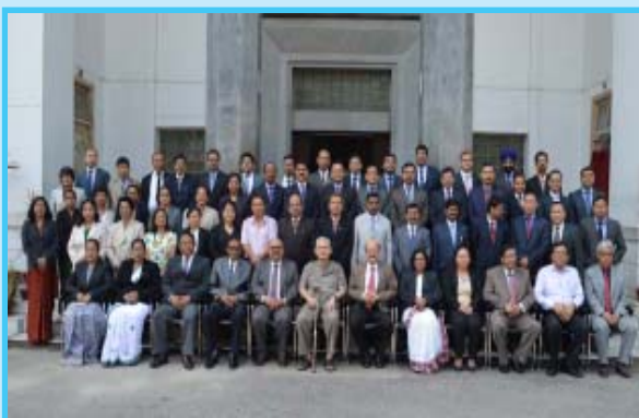
Judges with the participants