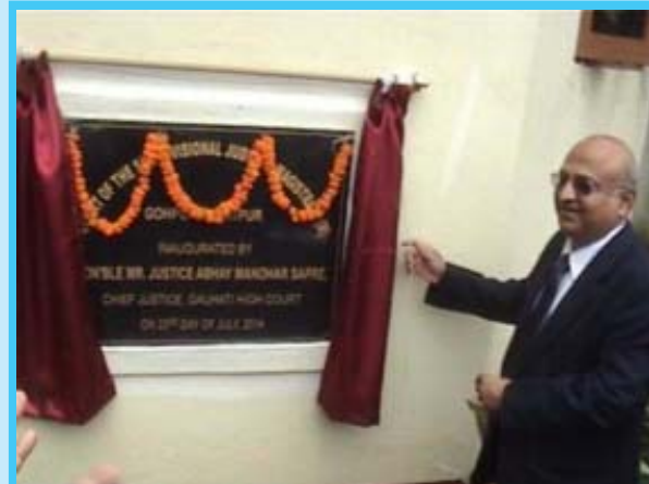
Chief Justice A.M. Sapre unrolling the plaque at Gohpur

The then Chief Justice A M Sapre, in a simple function, organized by the Sonitpur district judiciary on 23.07.2014, inaugurated the Sub-divisional Court at Gohpur, the place where the renowned freedom fighter Kanaklata Barua was born. The District and Sessions Judge, Sonitpur, Tezpur, judicial officers, a few members of the registry of the Gauhati High Court and members of Bar were present during the occasion. The opening of court at Gohpur will mitigate the hardship of the litigants as the courts will be easily accessible to them.