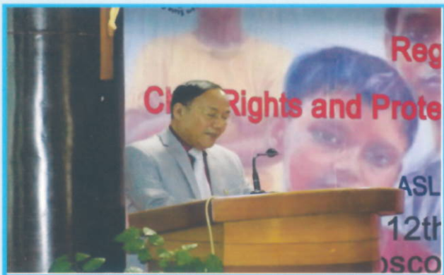
The Acting Chief Justice with his inaugural address