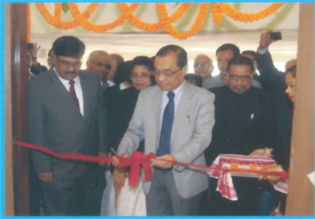
Justice Ranjan Gogoi inaugurating the ADR Centre