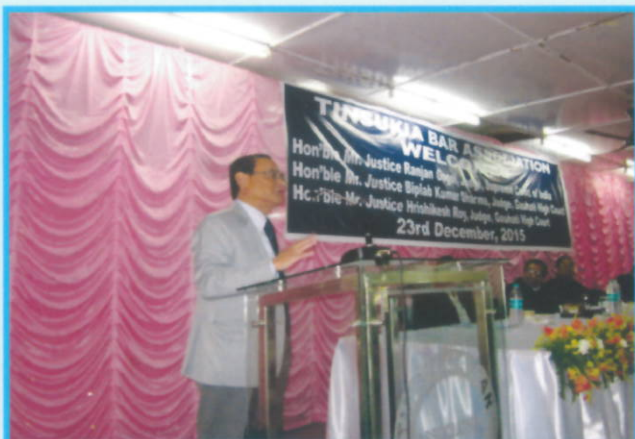
Justice Ranjan Gogoi speaking during the seminar at Tinsukia

The Tinsukia Bar Association organized a Legal Seminar on 23 rd December, 2015 on the topic New Age Challenges - Role of Bar and Bench . Addressing the seminar, Justice Ranjan Gogoi, Judge, Supreme Court of India emphasized that both Bar and Bench should prepare themselves for the emerging challenges in IPR, IT Laws, Surrogacy and also Commercial disputes which will require special expertise. Justice Hrishikesh Roy while speaking in the seminar stressed on the role of junior lawyers in the justice delivery system and also highlighted the importance of Alternate Dispute Resolution mechanism.