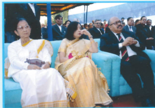
Dignitaries and section of audience at the function