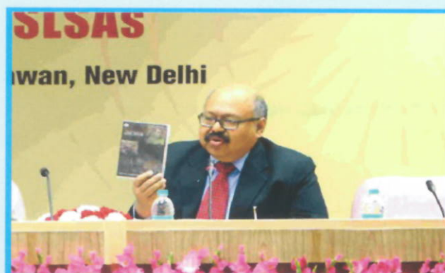
Justice Hrishikesh Roy introducing 'APNE AJNABI' at Vigyan Bhawan