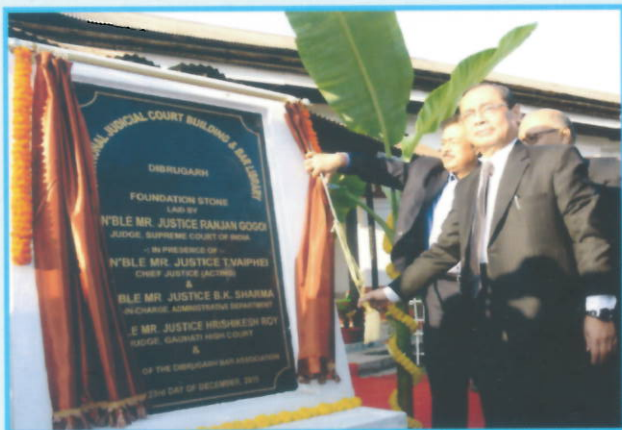
Justice Ranjan Gogoi unfurling the plaque at Dibrugarh Court