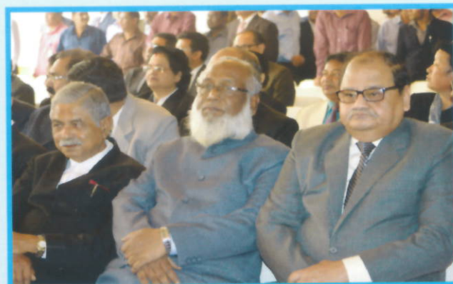
A section of advocates during the swearing-in ceremony

A Judge before he assumes his office, takes an oath to discharge his duties without fear or favour. He would breach his oath of office, if he accepts a prayer for recusal, unless justified.