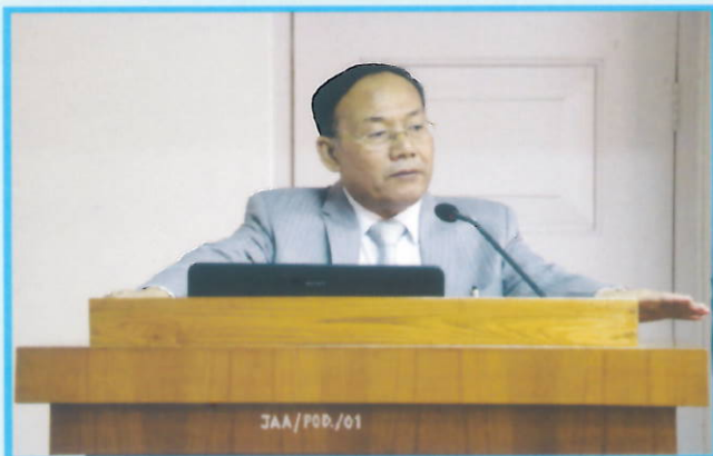
The Acting Chief Justice addressing the trainee Judicial Officers