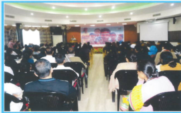
Audience present during the event at Guwahati