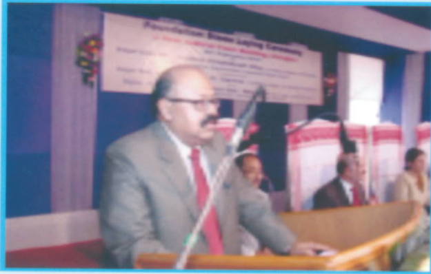
Justice Hrishikesh Roy during inaugural function