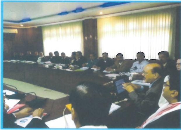
The Director, Judicial Academy interacting with public prosecutors at Silchar