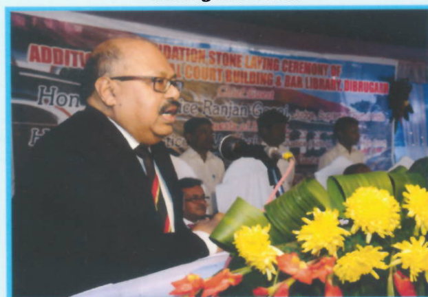
Justice Hrishikesh Roy, portfolio Judge, Dibrugarh district delivering his speech