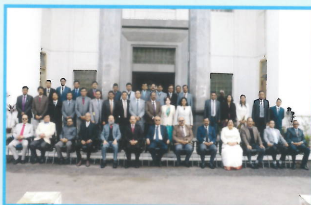
Judges with Judicial officers present at inaugural function

Dispensation of justice entails speedy justice and justice rendered with least inconvenience to the parties as well as to the witnesses. If a facility is available for recording evidence through video conferencing, which avoids any delay or inconvenience to the parties as well as to the witnesses, such facilities should be resorted to.