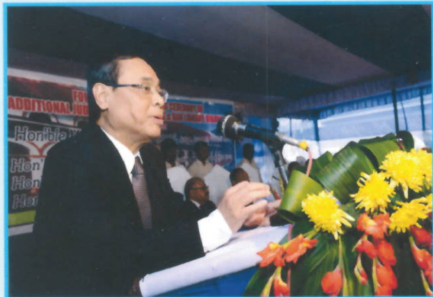
Justice Ranjan Gogoi addressing the Advocates, Judicial Officers at Dibrugarh