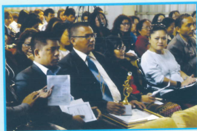
A section of audience present during the event at Aizawl