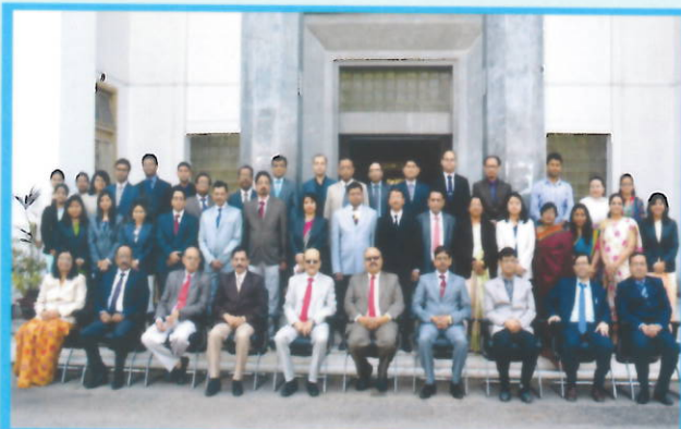
Justice Hrishikesh Roy with Judicial Officers