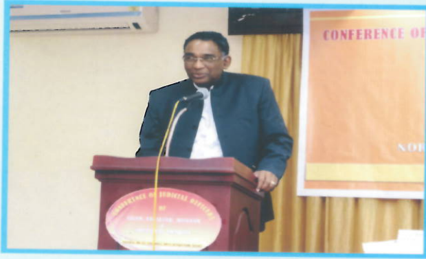
Justice J. Chelameswar with his key note address