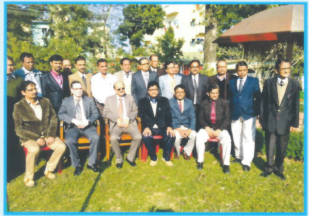
The Director with Judicial officers and the participants