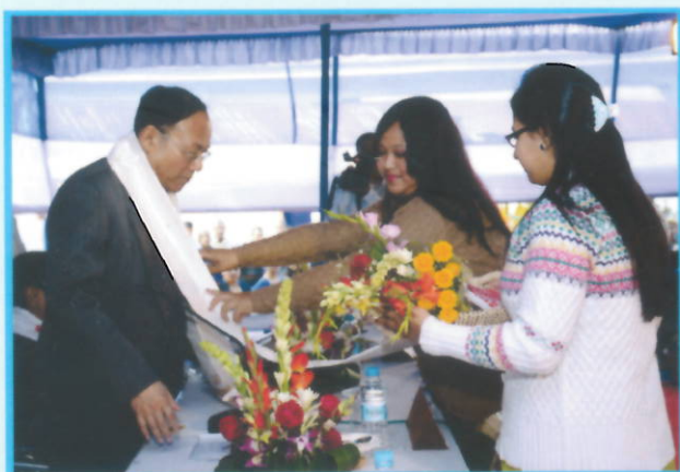
The Acting Chief Justice being felicitated during the event