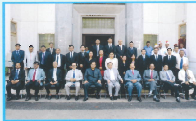
Judges and members of registry with trainee Judicial officers

The objective of judicial training is to locate, articulate, communicate and ultimately to apply those principles of rectitude to which our personal preferences, desires and emotions must be subordinated. We call it the rule of law.