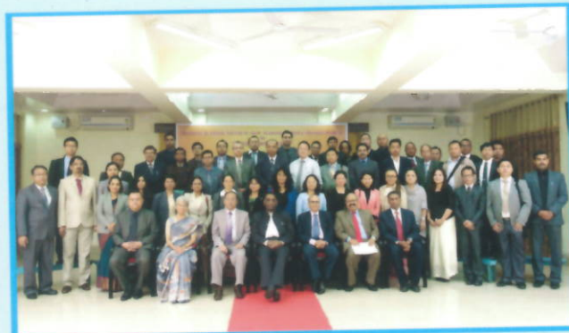
Judges, Resource persons with Judicial officers at Aizawl