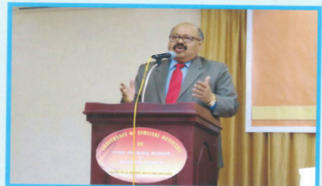
Justice Hrishikesh Roy addressing the Judicial officers during valedictory session