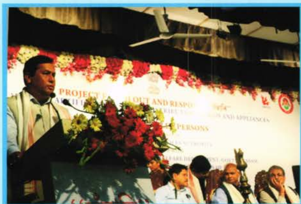
Chief Minister Sarbananda Sonowal addressing the সঁহাৰি programme

The programme was formally inaugurated in presence of Chief Minister of Assam, Chief Justice of Gauhati High Court, Executive Chairman, Assam State Legal Services Authority, Chief Secretary, Government of Assam and Principal Secretary, Social Welfare Department of Assam. All total 263 prosthetic limbs were fitted and 1738 assistive devices were distributed to the beneficiaries.