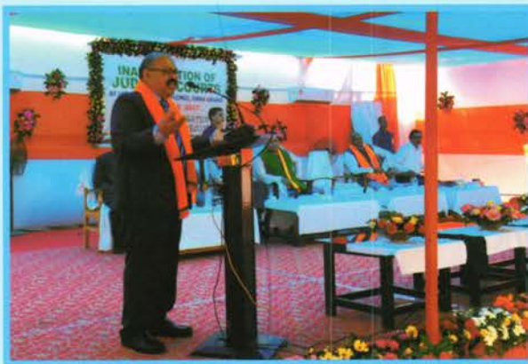
Justice Hrishikesh Roy in the Court Inauguration Programme, Haflong