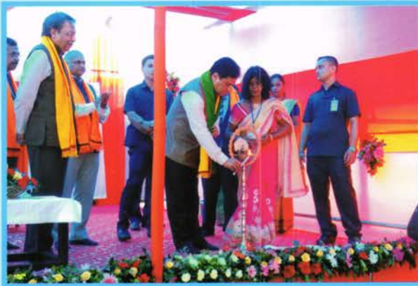
Sri Sarbananda Sonowal, Chief Minister, Assam at Haflong Court inauguration