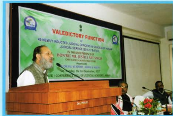
Justice Arup Kumar Goswami with his speech on Bar and Bench relationship