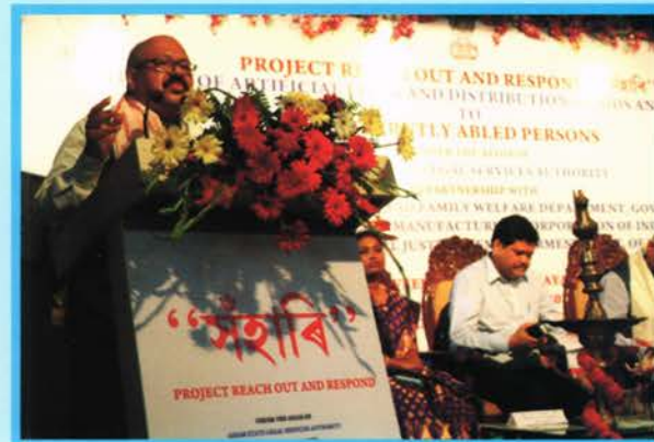
Justice Hrishikesh Roy in the “Reach out and Respond” programme, Dibrugarh