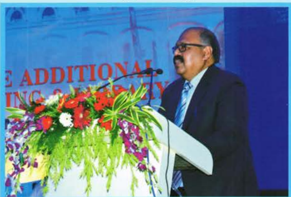
Justice Hrishikesh Roy in the Court/Bar Building inauguration, Dibrugarh