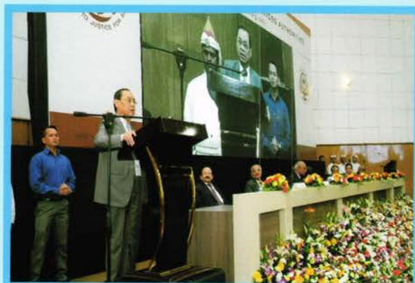
Justice Ranjan Gogoi, Judge, Supreme Court of India addressing the participants