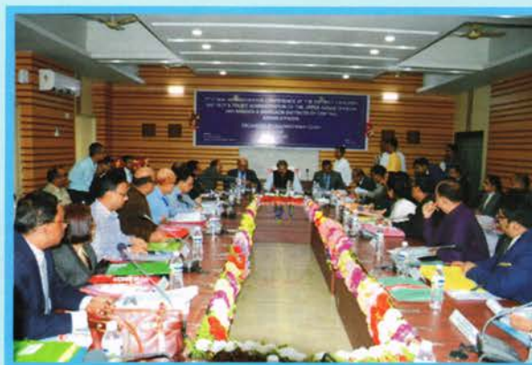
A cross section of the participants

Laws are a dead letter without courts to expound and define their true meaning and operation.