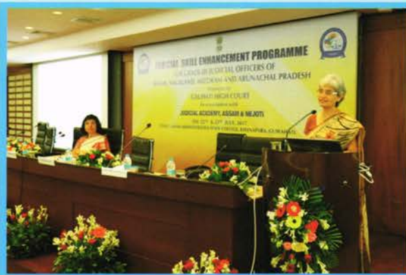
Justice Roshan Dalvi, Former Judge, Bombay High Court, addressing the Judicial Officers