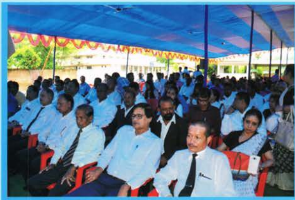
Audience at Diphu during the inaugural programme