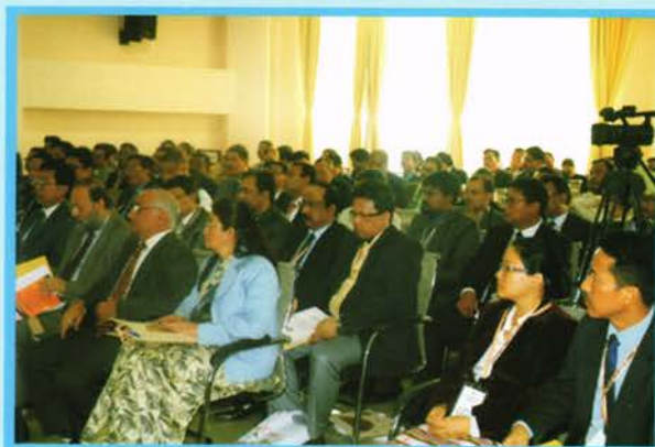
A cross-section of the participants during the Regional Meet at Shillong