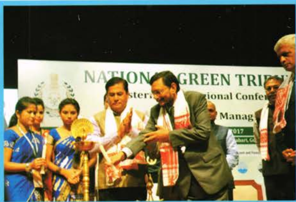
Justice S.A. Bobde, Judge, Supreme Court of India lighting the inaugural lamp