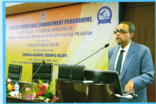
Justice Joymalya Bagchi of Calcutta High Court, addressing the Judicial Officers