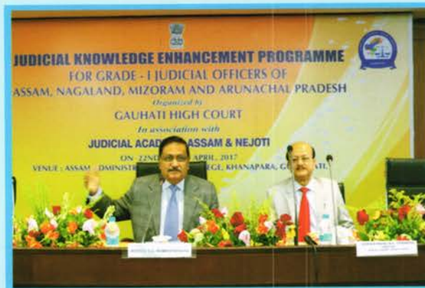
Justice S. J. Mukhopadhyaya, Former Judge, Supreme Court during inter-action