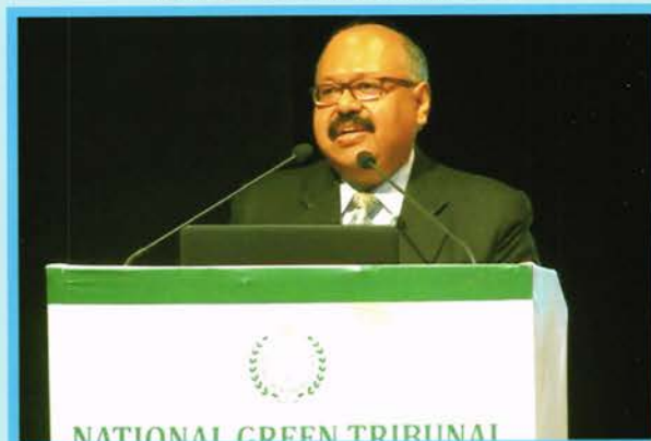
Justice Hrishikesh Roy during the plenary session at Guwahati

A two-day Eastern Zone Regional Conference was organised by the National Green Tribunal at Sankardev Kalakshetra, Guwahati. The conference highlighted the issue of environmental degradation and stressed on the use of technology to carry out waste management. The conference was attended by Justice S.A. Bobde, Justice U.U. Lalit, Justice A.K. Goel, Justice Amitava Roy (Judges, Supreme Court of India),