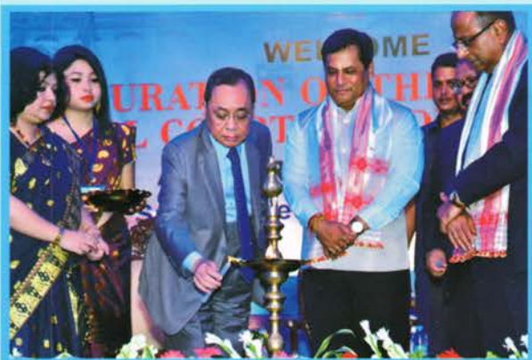
Justice Ranjan Gogoi lighting the ceremonial lamp along with Justice Amitava Roy