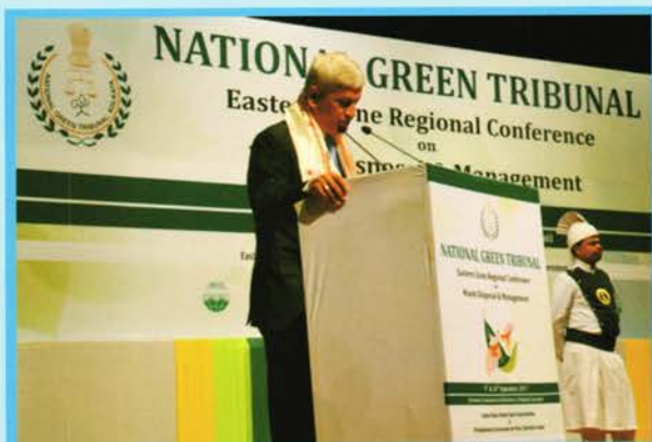
Justice U. U. Lalit, Judge, Supreme Court of India with his speech