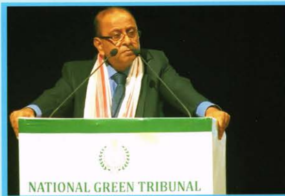
Justice Amitava Roy, Judge, Supreme Court of India at Green Tribunal Meet at Guwahati