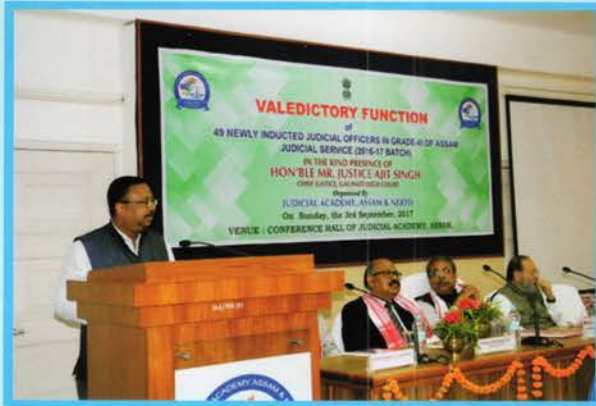
Justice Ujjal Bhuyan addressing the trainee Grade-III Officers