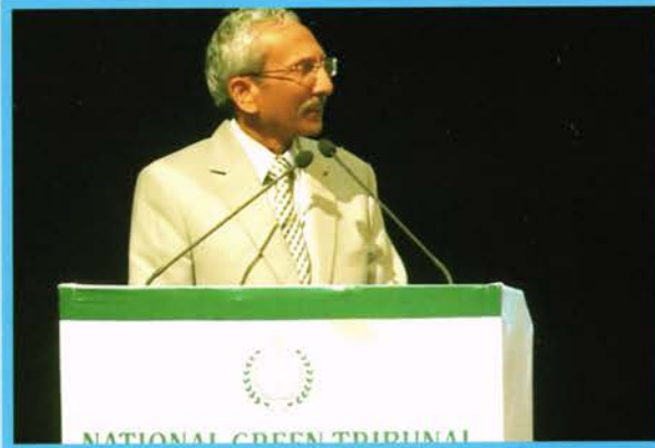
Justice A.K. Goel, Judge, Supreme Court of India addressing the gathering