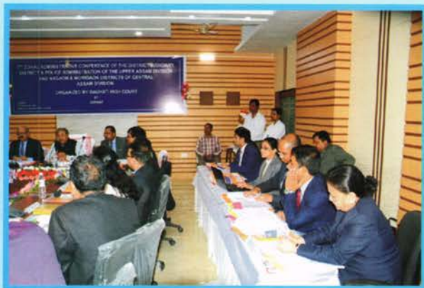
Members of the Registry during the Zonal Conference at Jorhat

The Chief Justice welcomed the participants in the conference and various topics relating to infrastructural requirements, disposal of seized psychotropic substances, appointment of Public Prosecutors, withdrawal of cases and inter-departmental administrative issues were discussed.