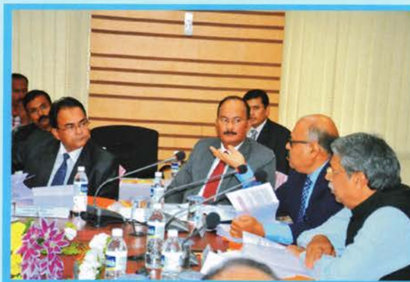
Interaction with the participants during the conference at Jorhat