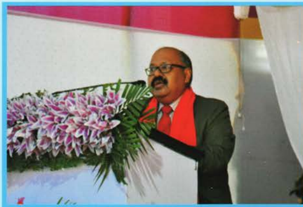
Justice Hrishikesh Roy on separation of Judiciary for Karbi Anglong district

Law and order exist for the purpose of establishing justice and when they fail in this purpose they become the dangerously structured dams that block the flow of social progress.