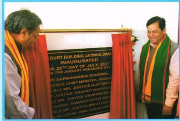
Chief Minister Sarbananda Sonowal and Chief Justice Ajit Singh unfurling the plaque of Court building