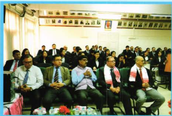
A cross section of the Hon'ble Judges and newly inducted Judicial Officers